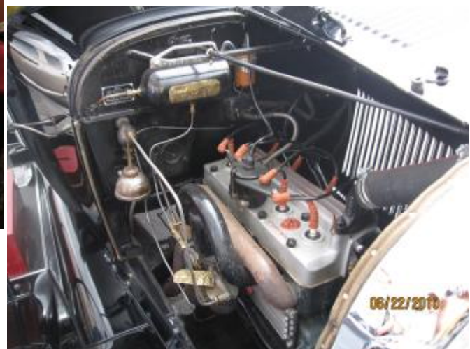
And plenty of power, with a Lion head with 2 spark plugs per cylinder. Owner says it will do 100 MPH.