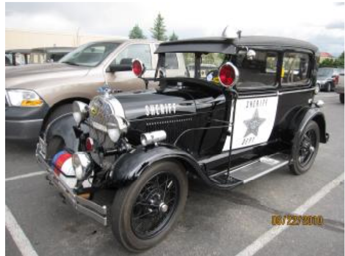
This one caught my eye in the parking lot, belongs to a Casper resident.