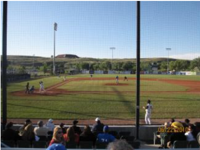
Nothing like an evening at the ole' ball game!