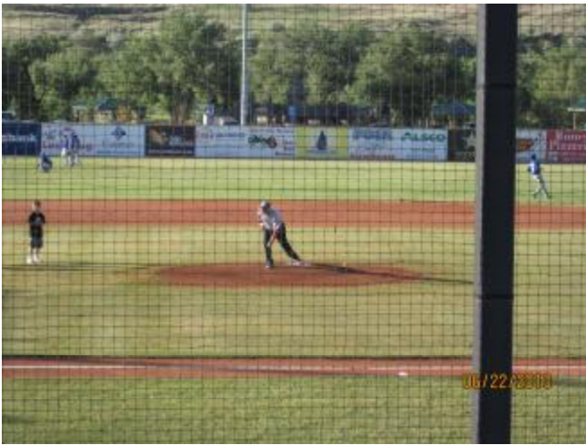
Dick Przywitowski threw out the first pitch.