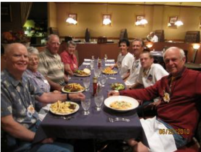
Lunch in Casper with Friends.