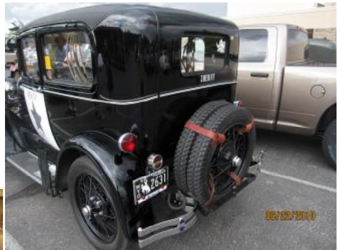
Snow tires for those rough Wyoming winters